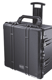
1640NF No Foam