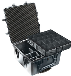
1644 With Padded Dividers