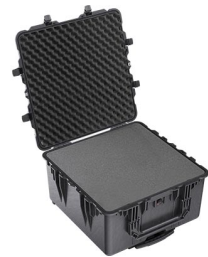
1640WF With Foam