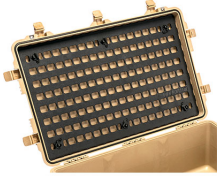
1650MP EZ-Click™ MOLLE Panel