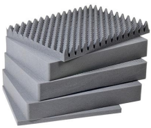
1661 5 pc. Replacement Foam Set