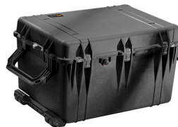
1660NF No Foam