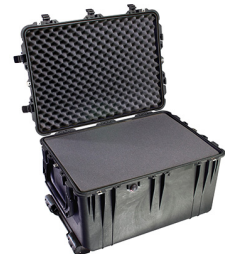
1660WF With Foam