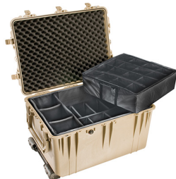
1664 With Padded Dividers