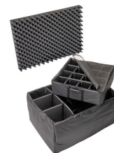
1665 Padded Divider Set