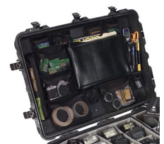
1669 Photo/Lid Organizer