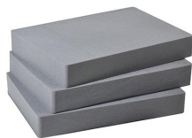
1662 Pick N Pluck™ Sections Only (set of 3)