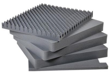
1691 5 pc. Replacement Foam Set