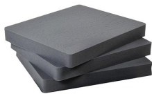
1692 Pick N Pluck™ Sections Only (set of 3)