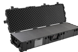
1770WF With Foam