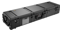
1770NF No Foam