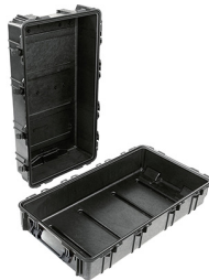
1780NF No Foam