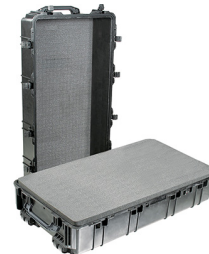
1780WF With Foam