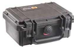
1120NF No Foam