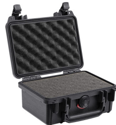
1120WF With Foam