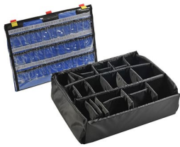
1555EMS EMS Accessory Set (Lid Organizer and Divider Set)