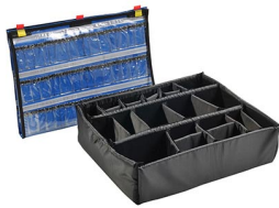
1605EMS EMS Accessory Set (Lid Organizer and Divider Set)