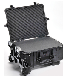
1610MWF With Foam