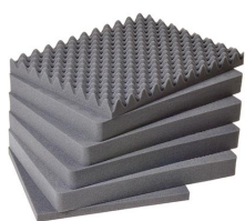
1621 6 pc. Replacement Foam Set