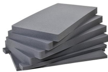
1781 6 pc. Replacement Foam Set