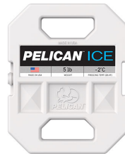
PI-5LB 5lb Ice Pack