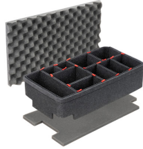
1535TPKIT TrekPak Case Divider Kit