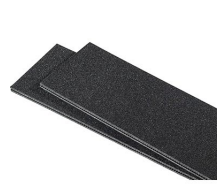
1510TPDIV Extra TrekPak Dividers