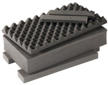
1535AirFS 5 pc. Replacement Foam Set