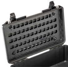
1535MP EZ-Click™ MOLLE Panel