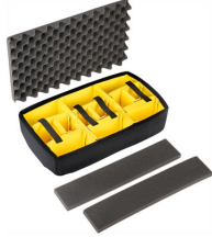
1535AirDS Padded Divider Set