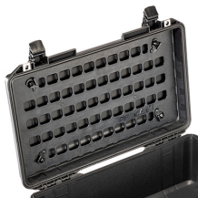
1535MP EZ-Click™ MOLLE Panel