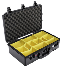
1555WD With Padded Dividers