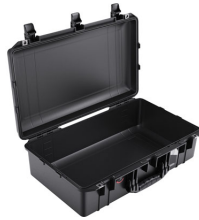
1555NF No Foam